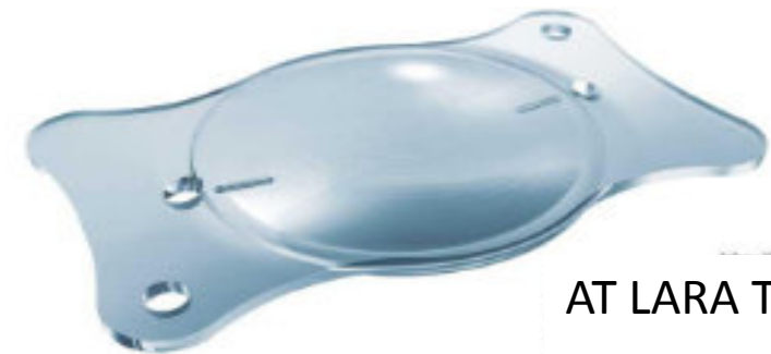
AT LARA TORIC